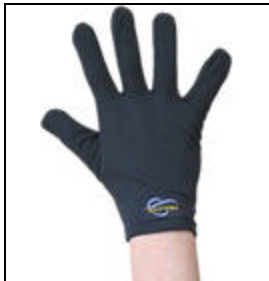
Full Finger FIR Gloves