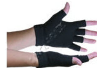
Open Finger FIR Gloves